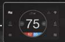
EcoNet Smart Thermostat