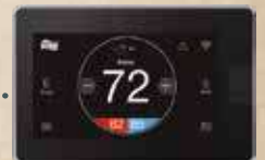
EcoNet Smart Thermostat